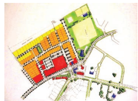
Plan for proposed indicative town centre expansion