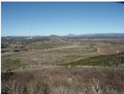
Former pine plantations in the Molonglo Valley.