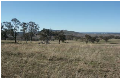
View from the Molonglo Valley towards Canberra.