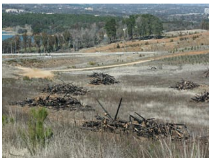
View over a section of the Molonglo Valley showing charred remains of the pine plantations destroyed in the 2003 bushfires.

Just west of Canberra's central area, the Molonglo Valley covers about a thousand hectares of undeveloped land, which was mostly covered in pine plantations until the bush fires of 2003. Always anticipated as a growth corridor for Canberra, the bush fires accelerated this process.