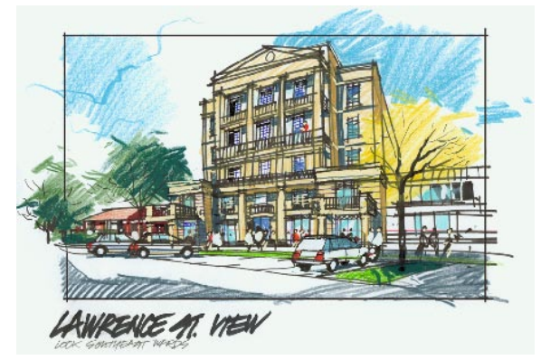
Proposed new Lawrence St mixed-use building.