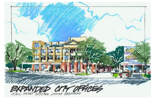
Proposed new City Offices.