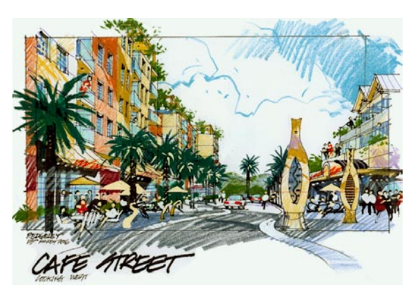
Proposed mid-rises along 'Café Street'.

A first major redevelopment occupies the northeast corner of High Street (the main street) and Elgin Blvd, a key quadrant of the CBD's epicentre. ESD preliminarily designed this development for the City, and now private owners are developing these lands in response to ESD's design. ESD was pivotally involved in the design negotiations for the City with the owners.